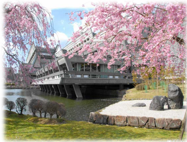
Kyoto International Convention Center